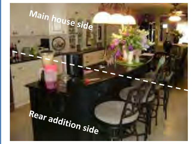
White dotted line represents location of original rear exterior wall of main house that separated rear addition.