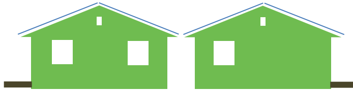
4 B & 4 C existing ranch , side elevations , ranch usually 24' to 26' wide