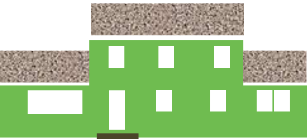
4 G convert ranch , same as 4 D ( 50 % of 1 st floor sq. ft. ) , however shifted. 4 H & 4 I convert ranch into split level ranch , side elevations of profile 4 G

As illustrated ,raised 2 nd story addition is approximately 50 % of present 1 st floor square footage. This percentage can decrease to as little as 33 % or increase to as much as 75 % of lower level. This variation is based on your needs ( more rooms ) and / or budget.