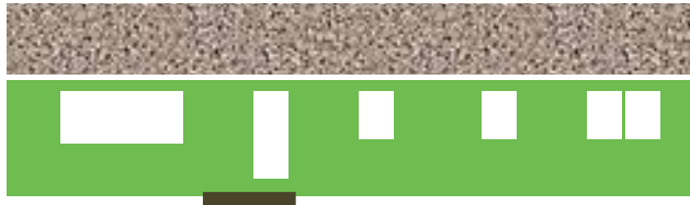
4 A existing ranch , front elevation, ranch usually 50' to 70 ' long