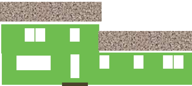
4 D convert ranch into split level ranch , front elevation