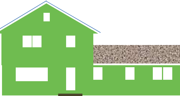
4 J convert ranch , same as 4 D , however reversed gable roof.

This option is primarily based on best location for new set of stairs leading to proposed 2 nd story addition. Also possibly trying to avoid cost of having to extend a chimney or fireplace or moving mechanical equipment in present ranch attic.